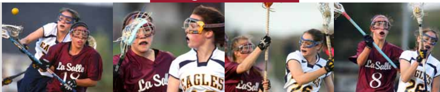
BARRINGTON TOPS LA SALLE IN LACROSSE: View the gallery at HSGameTime.com/rhodeisland

Tell us what you think at projosports.com/celtics