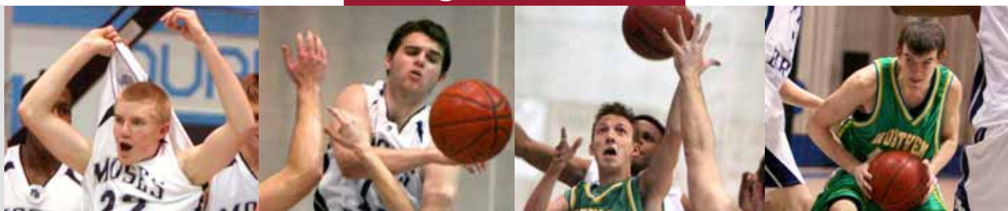
MOSES BROWN NIPS NORTH SMITHFIELD: View the gallery at HSGameTime.com/rhodeisland

Tell us what you think at projsports.com/patriots