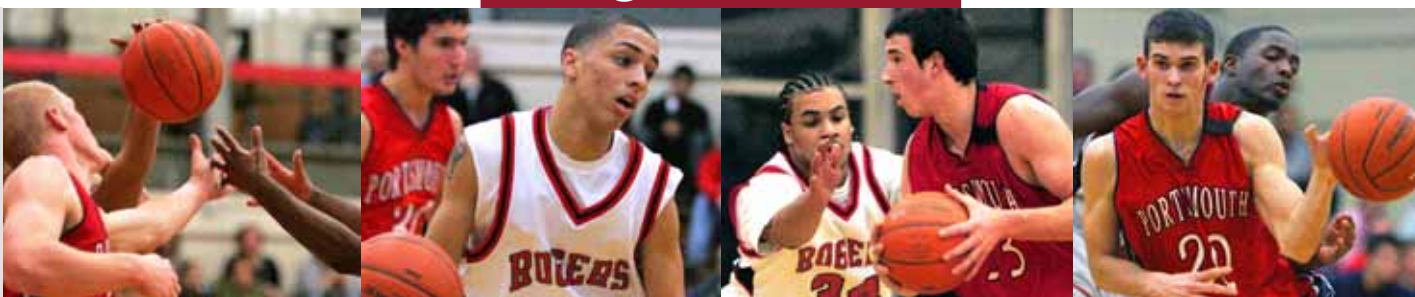
UNBEATEN ROGERS DOWNS PORTSMOUTH: View the gallery at HSGameTime.com/rhodeisland

Tell us what you think at projosports.com/patriots