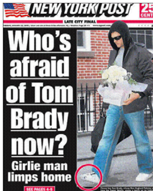
THE NEW YORK POST

The flowers Tom Brady was seen carting around New York City Monday certainly weren't for the New York Post.