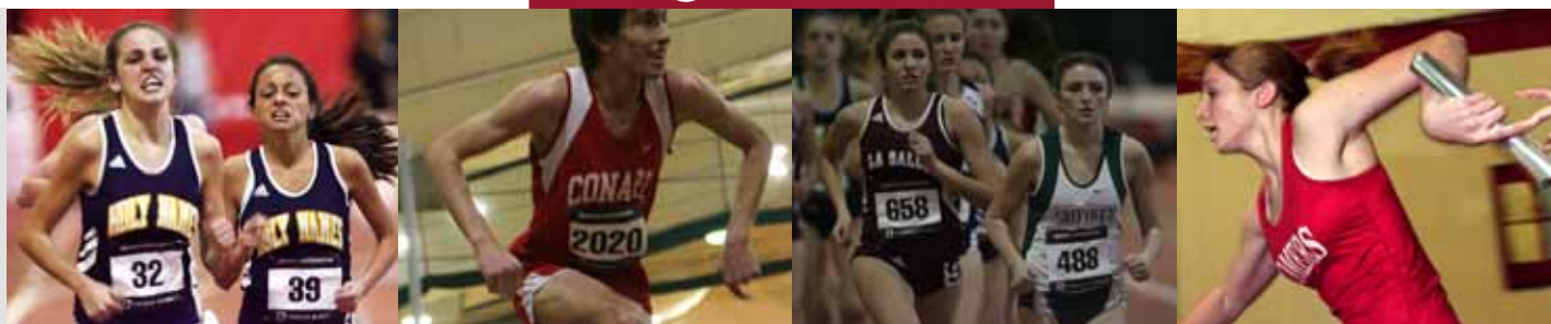
INTENSE COMPETITION AT BROWN INVITATIONAL: View the gallery at HSGameTime.com/rhodeisland